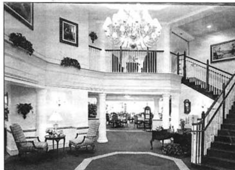
INTERIOR VIEW: How the accommodation will look inside

"Too often, developments of this type tend to be bland and uninteresting and don't actually respect the adjoining property," he added. "We've definitely got some planning gain but I think that gain has been particularly amplified by some good design