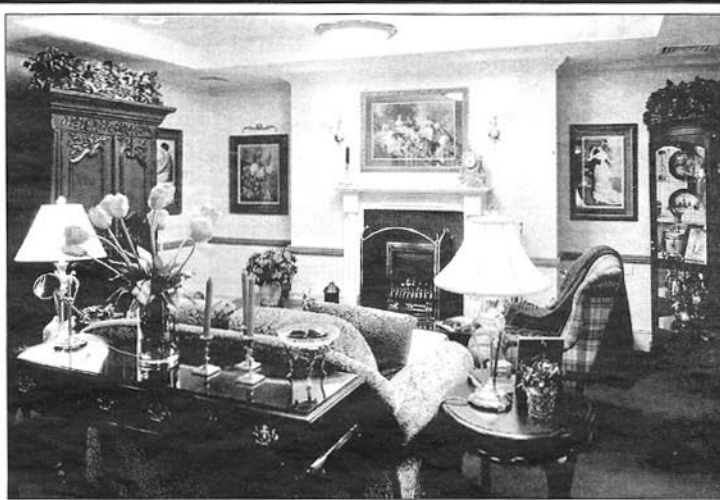
A NEW KIND OF HOME FOR OLD PEOPLE: Inside the flagship home